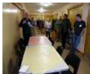
Foyer with folding door on the left closed

The café is separated from the foyer by folding doors which can be fully opened to double the café area.