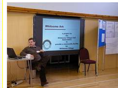
Projection screen in main hall