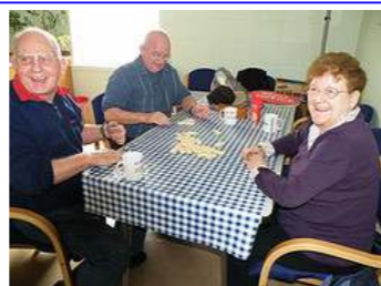
Social use of the meeting room.

There is a large hatch from the room to the foyer/café area which makes the room suitable for use as a bar/servery.